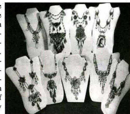
Jo Addie's display of necklaces.

More info: www.somewhereintime.tv/jewelry/index.html