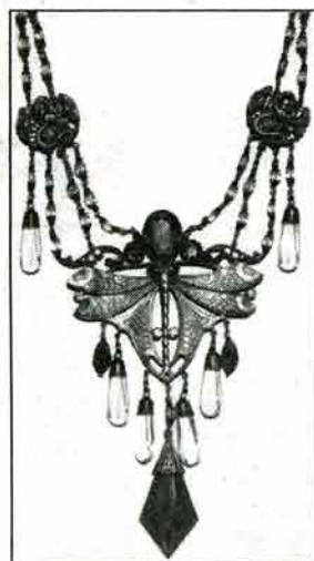
Art Deco Dragonfly in red & clear glass, $450.

away from everyone and padlocked the buildings, which is how they have remained since. Now that it is Czech Republic, the government is encouraging people who are family to come forward and make claim to the properties. But if no one comes forward, the buildings go up for sale, and that is what happened in this case. She bought this building and found the jewelry stashed in boxes inside...and an amazing store of hand-painted glass buttons in the clay cellar of the building."